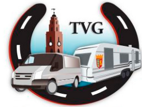
Traveller Visibility Group