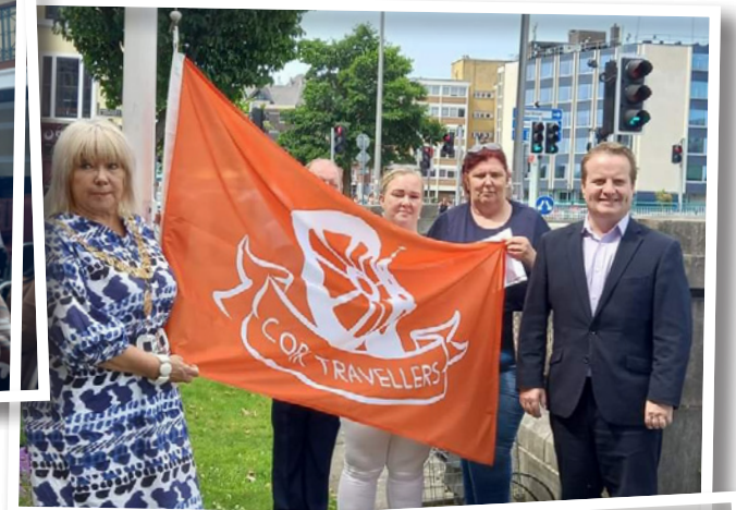
A selection of photographs from various events throughout 2022...